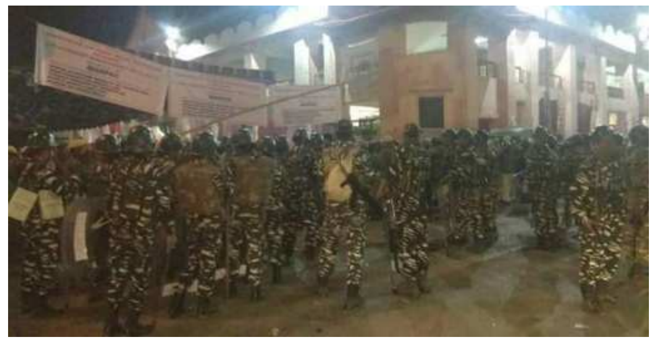
CRPF and State Police preparing to fight the unarmed women protestors at Khwaramband Keithel, at least 7 injured on FEb 10